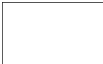
WHITE DIAMOND* [Surcharge of RM800 is applicable]