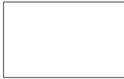
WHITE DIAMOND* [Surcharge of RM800 is applicable]