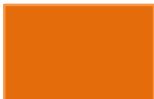
SUNFLARE ORANGE PEARL