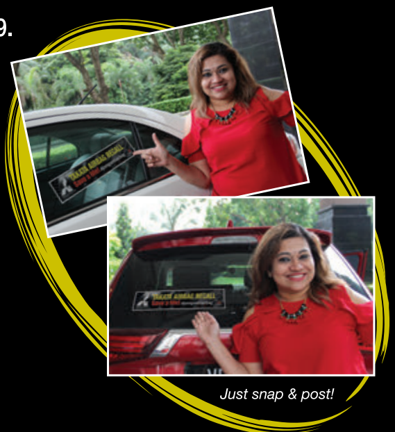
Just snap & post!